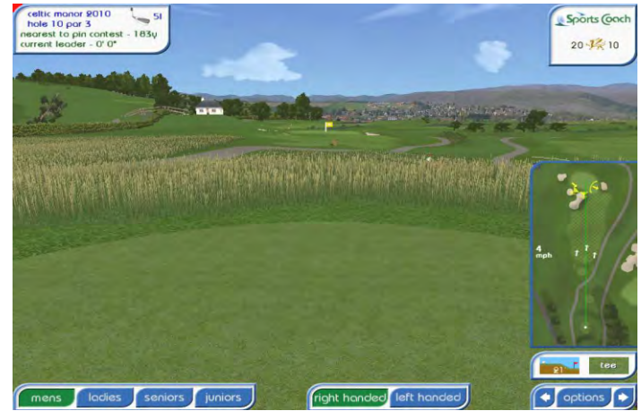
Celtic Manor 2010 Golf Course Simulation.