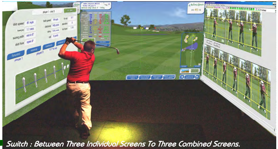
Switch : Between Three Individual Screens To Three Combined Screens.

The ultimate golf lesson is now possible by utilising the GPS Surround Academy, linked in with the superb GPS Golf Simulator and any two teaching programs such