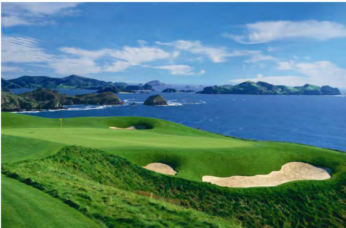
Kauri Cliffs Golf Course.

There are now 100 released courses on the GPS Golf Simulator easily the largest and best golf course library in the world. There are another 54 famous courses under construction, due to the extremely realistic simulations that the Golf Simulator develop. Such as world renowned courses Banff Springs, Cape Kidnappers, Chateau Whistler, European, Kauri Cliffs and San Roque. Ensuring that all simulator customers can continually obtain, the very best courses on their GPS Golf Simulator. Many leading advertising agencies are currently booking the Golf Simulator and Celtic Manor 2010, so that their clients get the maximum marketing exposure during the Ryder Cup.